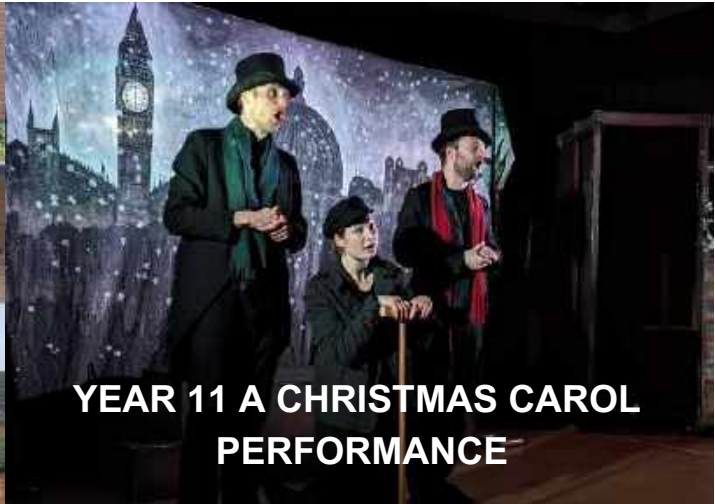
YEAR 11 A CHRISTMAS CAROL PERFORMANCE