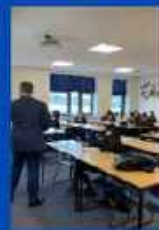
Year 10 Careers Day