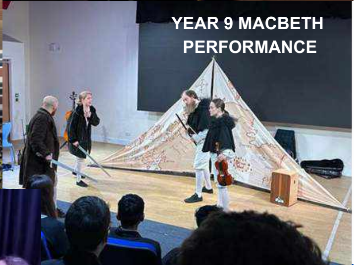
YEAR 9 MACBETH PERFORMANCE